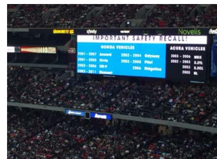
A recall message was displayed on the stadium video board at the 2016 Honda Battle of the Bands, an event attended by 63,000+ in Atlanta, Georgia.

Full page ads in English and Spanish newspapers are designed to grab readers' attention and urge them to get their vehicles repaired.