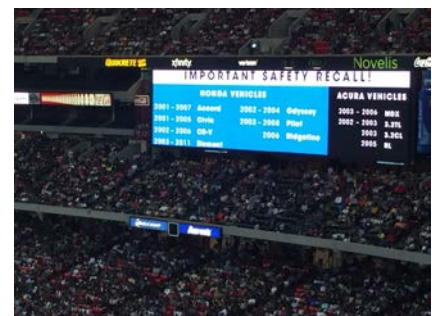
A recall message was displayed on the stadium video board at the 2016 Honda Battle of the Bands, an event attended by 63,000+ in Atlanta, Georgia.

Full page ads in English and Spanish newspapers are designed to grab readers' attention and urge them to get their vehicles repaired.