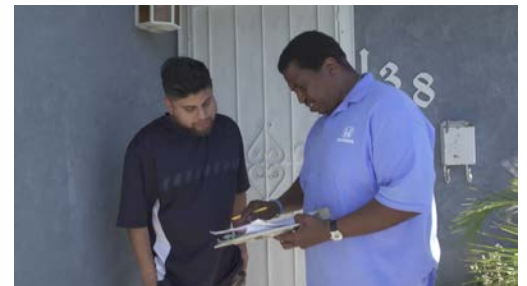
Honda associates are going door-to-door in the effort to reach owners of older vehicles with recalled high risk “Alpha” airbag inflators.