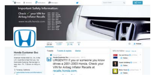
Honda Customer Service is using social media, including Twitter and Facebook, to respond to the concerns of customers affected by Takata airbag inflator recalls.