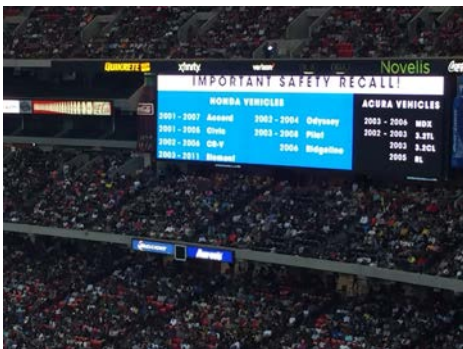
A recall message was displayed on the stadium video board at the 2016 Honda Battle of the Bands, an event attended by 63,000+ in Atlanta, Georgia.

Full page ads in English and Spanish newspapers are designed to grab readers’ attention and urge them to get their vehicles repaired.