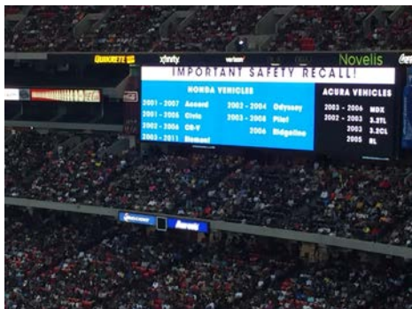
A recall message was displayed on the stadium video board at the 2016 Honda Battle of the Bands, an event attended by 63,000+ in Atlanta, Georgia.

Full page ads in English and Spanish newspapers are designed to grab readers’ attention and urge them to get their vehicles repaired.