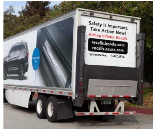
Honda has transformed Parts & Service trucks into rolling billboards . The trucks cover more than 100,000 miles per day, exposing the issue to drivers across the country.