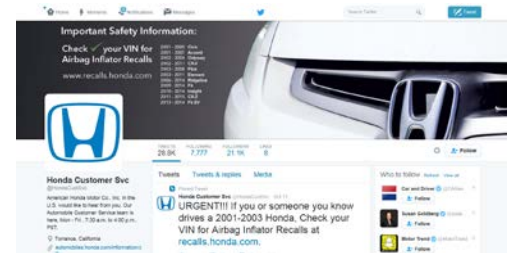
Honda Customer Service is using social media, including Twitter and Facebook, to respond to the concerns of customers affected by Takata airbag inflator recalls.