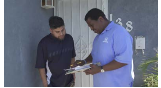
Honda associates are going door-to-door in the effort to reach owners of older vehicles with recalled high risk “Alpha” airbag inflators.