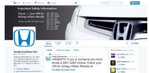
Honda Customer Service is using social media, including Twitter and Facebook, to respond to the concerns of customers affected by Takata airbag inflator recalls.