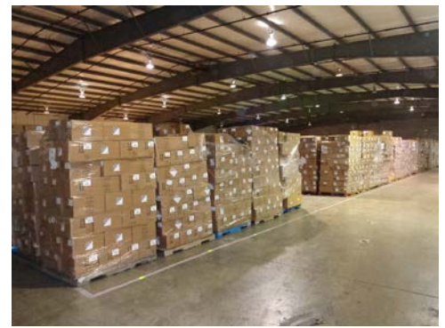
Honda purchased over 130,000 airbag modules containing recalled airbag inflators from salvage yards, preventing them from being reinstalled in vehicles.