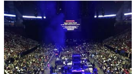
A recall message was displayed on the video boards at multiple Civic Tour music events, including this one in Houston, TX on 9/29/2016.