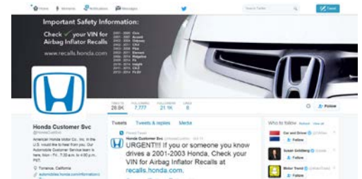
Honda Customer Service is using social media, including Twitter and Facebook, to respond to the concerns of customers affected by Takata airbag inflator recalls.