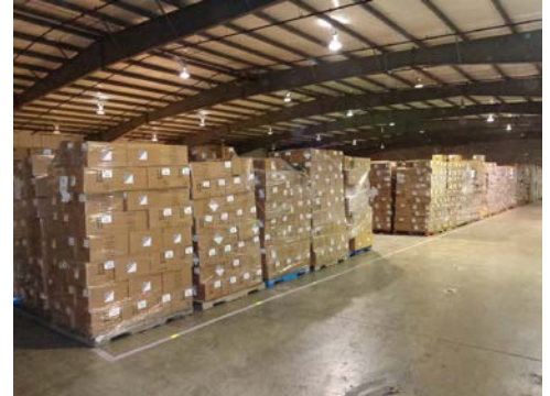
Honda purchased over 183,000 airbag modules containing recalled airbag inflators from salvage yards, preventing them from being reinstalled in vehicles.