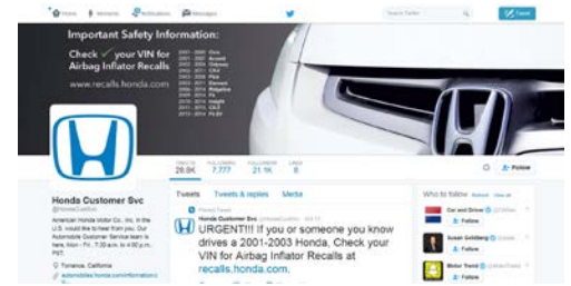
Honda Customer Service is using social media, including Twitter and Facebook, to respond to the concerns of customers affected by Takata airbag inflator recalls.