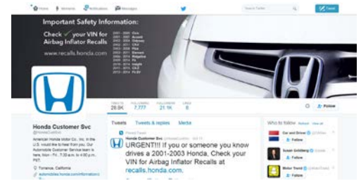
Honda Customer Service is using social media, including Twitter and Facebook, to respond to the concerns of customers affected by Takata airbag inflator recalls.