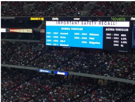
A recall message was displayed on the stadium video board at the 2016 Honda Battle of the Bands, an event attended by 63,000+ in Atlanta, Georgia.

Full page ads in English and Spanish newspapers are designed to grab readers’ attention and urge them to get their vehicles repaired.