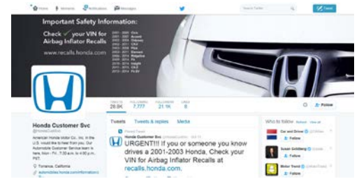
Honda Customer Service is using social media, including Twitter and Facebook, to respond to the concerns of customers affected by Takata airbag inflator recalls.