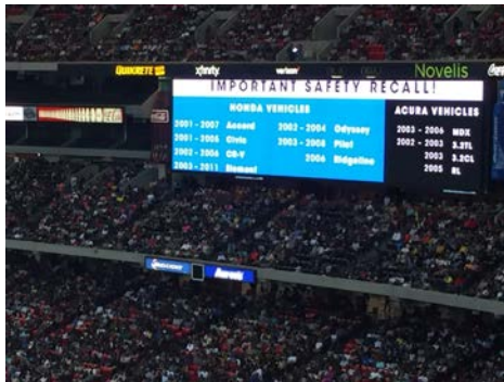
A recall message was displayed on the stadium video board at the 2016 Honda Battle of the Bands, an event attended by 63,000+ in Atlanta, Georgia.

Full page ads in English and Spanish newspapers are designed to grab readers’ attention and urge them to get their vehicles repaired.